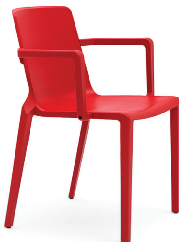
PLAZA CHAIR W/ARMS

Wide: 50cm / Depth: 55cm / Height: 80cm / Seat Height: 44cm